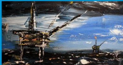
OIL, GAS AND OFFSHORE ENERGY