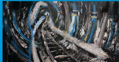
ROCK, MINING AND TUNNELLING